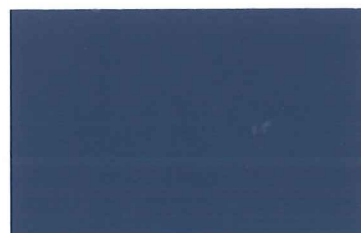
12 - HARBOR BLUE